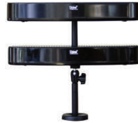
LT-84 and LA-141 with Wall Mount