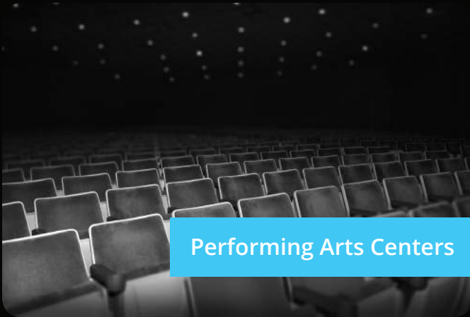
Performing Arts Centers