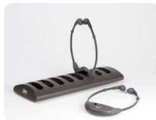
LA-350 8-Unit IR Charging/Storage