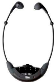
LR-42 IR Stethoscope 4-Channel Receiver