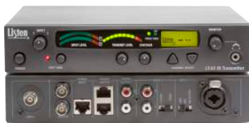
LT-82 Stationary IR Transmitter