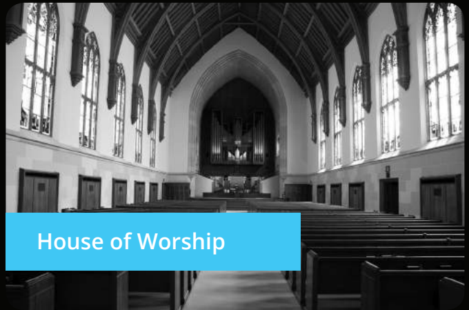
House of Worship