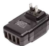
LA-423 4-Port USB Charger used for charging the Listen iDSP receivers. Station.