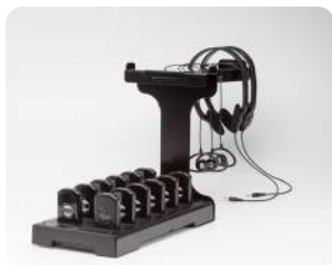
LA-381 Intelligent 12-Unit Charging Tray.