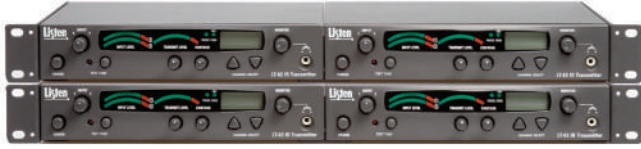
LT-82 with Rack Mount