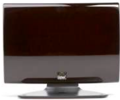
LA-140 Stationary Radiator