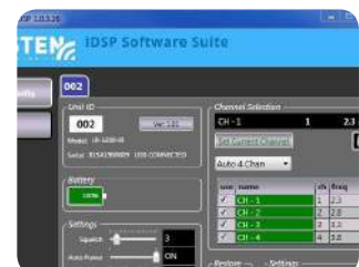
The Listen iDSP Software suite